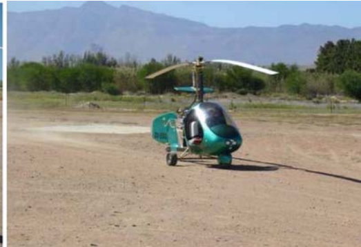
RAF2000 with stabilator

Although the horizontal stabilizer had made a difference to my RAF2000 and was a lot easier to fly than a standard RAF, there was no comparison to how the RAF2000 flew with a stabilator on. The pilot work load was reduced the aircraft was not restricted in any of its maneuvers. I set the speed at 60mph and that is where it stayed from take off to landing. I did a full circuit without touching the stick. You can set the speed up to 90 mph the trim improves with airspeed and when you find out that a guy like Duane Hunn invented it who has 8500 gyro hours 5500 hours in a RAF2000 he certainly knew what he was doing. I was so pleased with the stabilator that I ordered one and it will replace my H/ stabilizer.