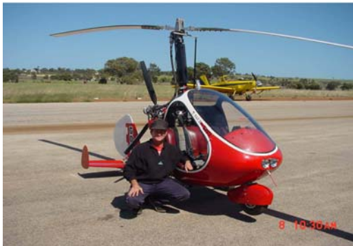
My RAF2000 with H/Stabilizer fitted.

I have a horizontal stabilizer on my RAF2000 and was interested in what the differences would be.